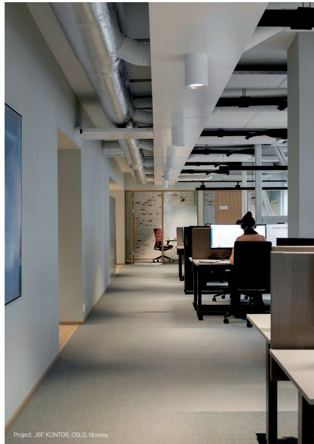
Project: JBF KONTOR, OSLO, Norway